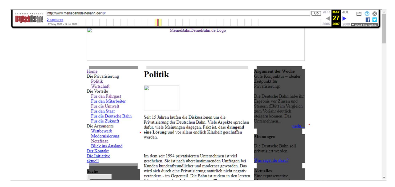
Figure 2: Screenshot of the archived website

I will now turn to the frames which I identified on the website. For the website I chose every section on the menu as a singular text, a decision which is made easy by the fact that the different sections are about specific policy topics. Figure 2 shows a screenshot of the archived website for clarification.